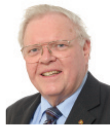
Sir Graham Bright Cambridgeshire Police & Crime Commissioner

The Council Tax you pay goes towards the cost of providing a wide range of services provided by Cambridgeshire County Council, Huntingdonshire District Council, Fire and Police services.